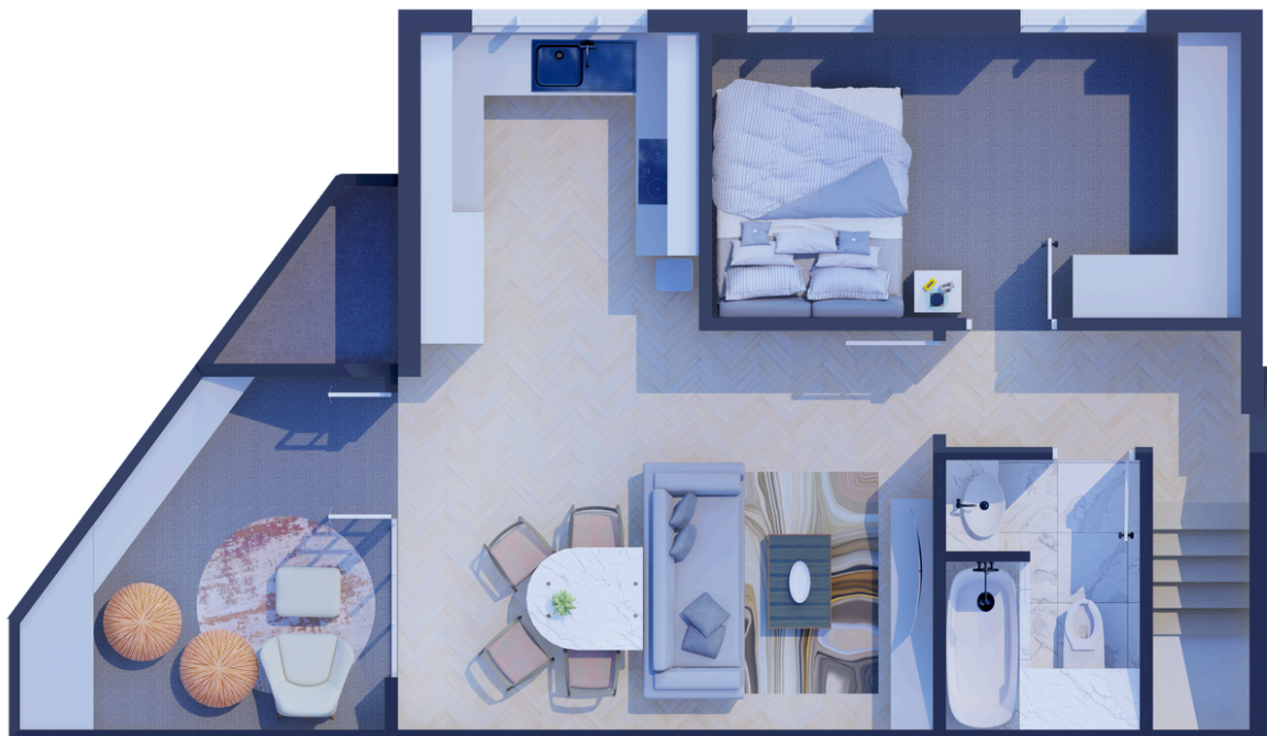
FLAT 4 FLOOR PLAN (SECOND FLOOR)

BEFORE PHOTO; PROPERTY UNDER CONSTRUCTION