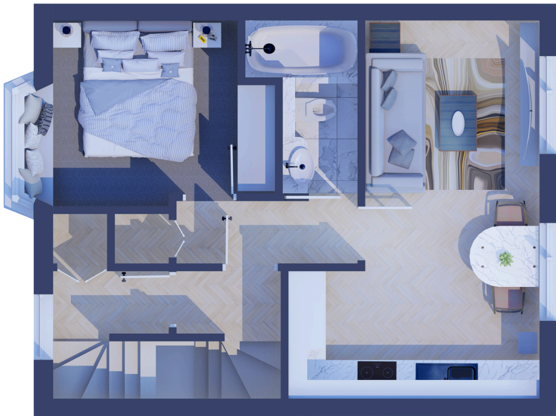
FLAT 3 FLOOR PLAN (FIRST FLOOR)

BEFORE PHOTO; PROPERTY UNDER CONSTRUCTION