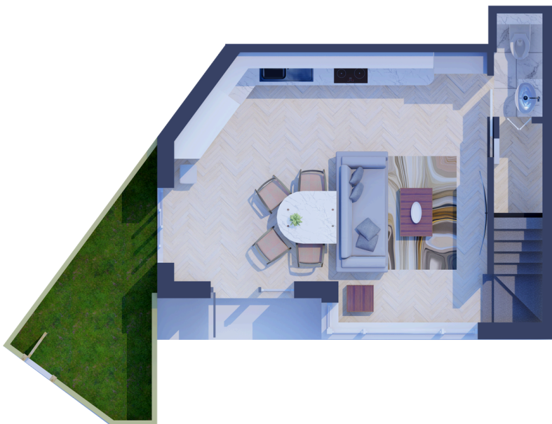
FLAT 1 FLOOR PLAN (GROUND FLOOR)

BEFORE PHOTO; PROPERTY UNDER CONSTRUCTION